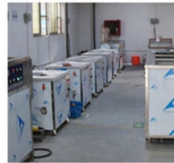
③ Product test