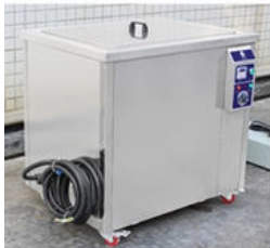
④ Finished product