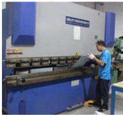
① Material processing