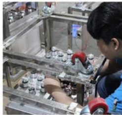
② Product assembling