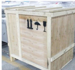
⑤ Product packaging