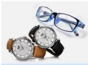
Watch & Eyeglasses