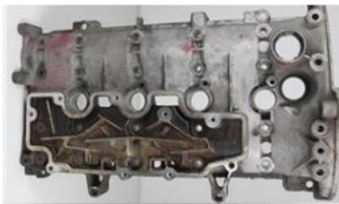
How to clean?