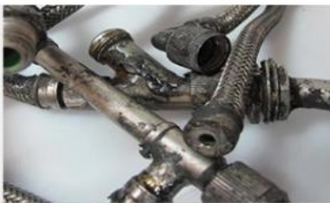
How to clean?